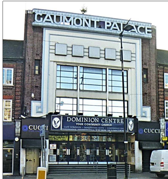
Gaumont Palace, Wood Green, London

A 'Friends' Group' has been formed to attempt to return the Regent at Blackpool to film exhibition, which aspiration is endorsed by the C.T.A.