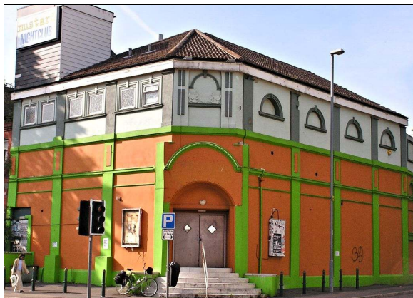
Alexandra Picturedrome, Coventry

The Hart Centre project has expressed interest in renovating the Granada in Maidstone as a centre for 'arts, culture, education and enterprise', including cinema, performance and catering activities.