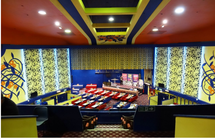
The interior of the Regal/ABC Bridlington

It is both disappointing and perturbing to report that three comprehensive listing applications submitted by the CTA to Historic England have been refused. In addition to the three cinemas concerned, which comprise the Regal at Bridlington, Towers at Hornchurch and Carlton in London's West End, the Coronet in London's Elephant and Castle district, proposed for listing by the Theatres Trust, has also been rejected.