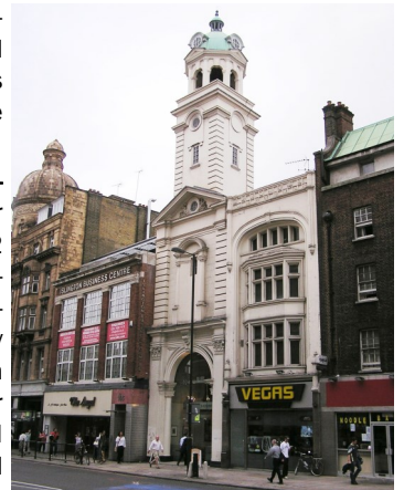
The Angel in April 2006

A second cinema, the Angel Picture Theatre in Islington, is under threat from the Crossrail 2 scheme. The auditorium was demolished in 1974 but the impressive tower feature and balcony entrance survive. (The Curzon in Shaftesbury Avenue is the other cinema endangered by the rail project, as previously detailed here).