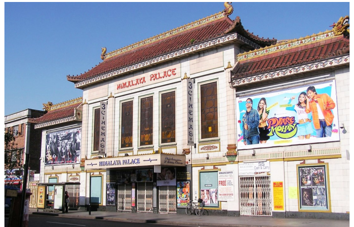
The Himalaya Palace Southall in April 2006

The Cambridge office of Historic England has invited the CTA to become involved in the pre-application process relating to the proposed conversion of the State at Grays into a JD Wetherspoon's hostelry.